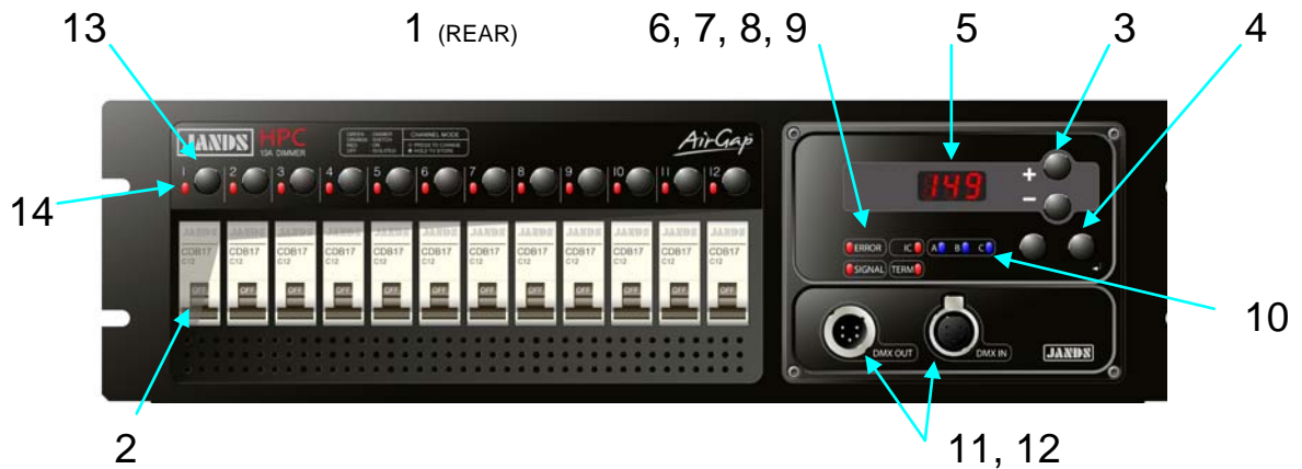
Figure 2: HPC front panel layout

Refer to Figure 2 for a description of the front panel controls.