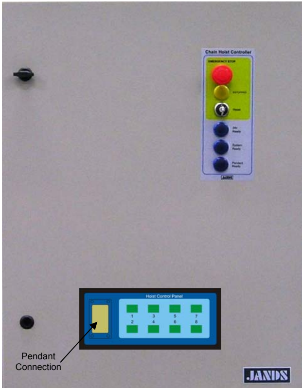
8 Way Switchgear Cabinet with integral Control Surface